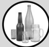
Clean Glass Bottles and Jars