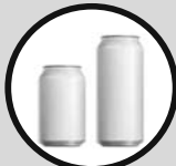
Clean Aluminum Cans