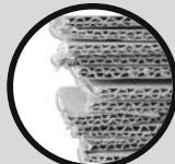
Dry Flattened Cardboard