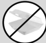
NO Polystyrene Foam or Styrofoam™