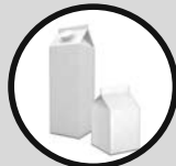
Clean Milk and Juice Cartons