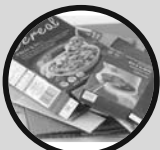
Dry Paperboard Boxes