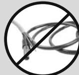
NO Garden Hoses, Cords, Ropes, or Wires