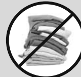
NO Clothing, Shoes, or Textiles