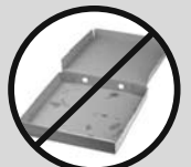
NO Soiled Paper Items