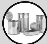
Clean Steel and Tin Metal Containers