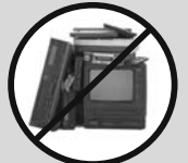
NO Electronics (Recycle at a Community Collection Center)