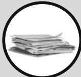
Dry Paper, Newspaper, and Junk Mail