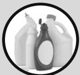
Clean Plastic Bottles and Containers (caps on)