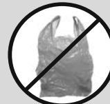
NO Plastic Bags or Film