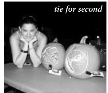
tie for second